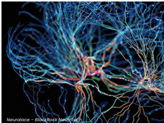
Neuralace - BlackRock Neurotech